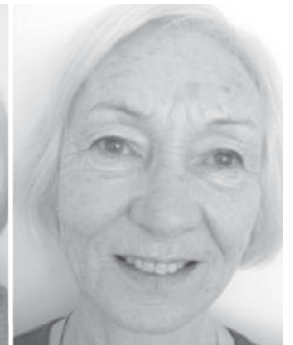
5 months after